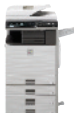
MX-3100N shown with optional inner finisher

The MX-2600N/3100N offers a choice of two high-performance finishers that can always give your documents a professional look and feel. You can save time and money by minimizing outsourced color jobs such as proposals, presentations or newsletters. Choose from a compact inner finisher or floor-standing saddle-stitch finisher. Both models offer three-position stapling and an available 3-hole punch.