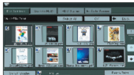
Sharp's easy-to-use document filing system with thumbnail preview

Sharp's easy-to-use Document Filing System provides up to 30 GB of hard drive space to store frequently used files like forms and templates. Plus, with Sharp's thumbnail preview mode, stored jobs can be located and retrieved quickly. An advanced backup system and PIN-access security helps ensure that your files are safe.