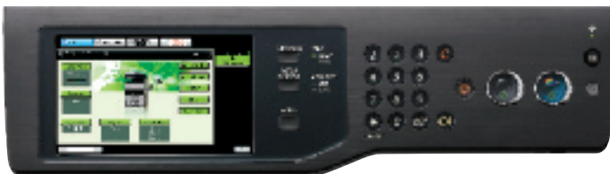
Large 8.5" (diagonally measured), high-resolution touch-screen display

With a new 8.5" (diagonally measured) high-resolution touch-screen color display and a powerful 800 MHz multi-tasking controller , the new MX-2600N and MX-3100N color workgroup document systems can help elevate your office productivity to the next level. The intuitive menu navigation system with razor sharp graphics makes operating the MX simple and easy. With Sharp's true multi-tasking controller, complex color print jobs can be processed quickly, even while documents are being scanned. But that's just the beginning—with a standard 100-sheet reversing document feeder , automatic duplexing, electronic sorting and integrated offset stacking, you'll complete even large jobs in a snap.