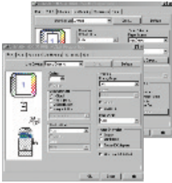
Sharp's easy-to-use print drivers make accessing all of the MX Color features simple and easy

With the new MX-2600N and MX-3100N, your business can produce brilliant, high quality color documents, as well as razor-sharp B&W documents. Plus, with 1200 x 1200 dpi resolution, even documents