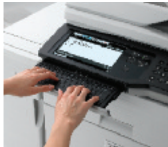
Standard retractable keyboard makes data entry quick and easy

For workgroups that perform a significant amount of data entry, the new MX-2600N and MX-3100N color workgroup document systems include a standard retractable keyboard. Designed to simplify e-mail address and subject line entries, as well as repetitive scanning tasks and user authentication, the built-in keyboard offers users a familiar ergonomic interface.