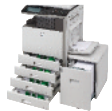
On-line paper capacity stores up to 5,600 sheets with options

Sharp's MX color workgroup document systems deliver professional performance and optimal productivity to satisfy your daily production needs. Copy/print speeds up to 26 ppm and 31 ppm respectively (in both color or B&W) help you to meet project deadlines with time to spare. The flexible paper handling system can feed up to 110 lb index stock through the paper trays and up to 140 lb index through the bypass tray. With available on-line paper capacity of up to 5,600 sheets, the MX-2600N/3100N is ready when you are.