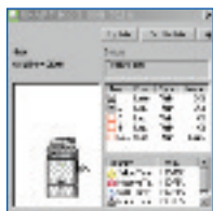
Printer Status Monitor