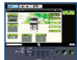
Remote Front Panel