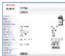
Embedded Web Page