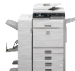
MX-3100N shown with optional saddle stitch finisher