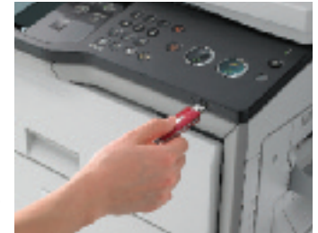
USB 2.0 port is located on the front panel of the machine for easy access

With Direct USB printing, users can print color or B&W files in a variety of popular formats directly from USB memory devices such as a ThumbDrive™ or ClipDrive™.* Need to print PDF brochures in a hurry for a big meeting? It's easy with the MX Color Series, just plug in your portable USB memory device, select the file, and your job prints immediately.